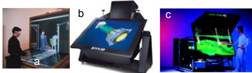
Figure 8: a- Barco&TAN's Holobench, b- Barco's Baron Immersive Table and c- [Fakespace]'s Immersadesk R2

For a wide range of applications, full-body immersion is not required and achieving arm and hand immersion in a workbench-style environment is enough. For instance, a medical application for surgery training for which all action is focused near and around the operating table may only require a workbench immersive environment. Workbenches can also be very useful for visualizing maps and digital terrain models. Immersive workbenches are special projection systems that have the shape of a table and onto which stereoscopic images can be projected. Some L-shaped configurations with two intersecting surfaces also prove useful. Even though it is simpler than a CAVE, an immersive workbench still requires 3D glasses and a tracking system [Barco] (see Figure 8a-b) [Fakespace] (see Figure 8c) [Trimension].