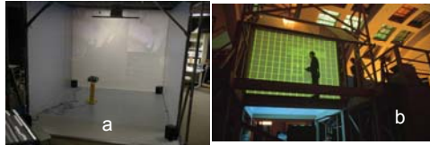
Figure 7: a- NCSA's CAVEs and b- VR-Cube