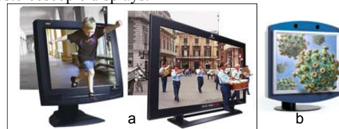
Figure 5: a- Stereographics' lenticular autostereoscopic technology. 18" monitor at 6K$ and 42" plasma screen at 15K$ and b- [SeeRealTechnologies] system with embedded tracking system

Due to patents and intellectual property issues, each vendor has developed his own technology for generating autostereoscopic displays.