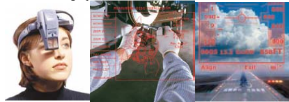
Figure 2: MicroVision's Nomad System and examples of AR applications using this system

[MicroVisionInc.] is the unchallenged leader in commercializing VRD technology. The company already owns such a large number of patents that it almost blocks all competition. It currently produces the Nomad personal display system models of VRD for AR applications. As shown on Figure 2, the Nomad generates very bright monochrome graphics and text.