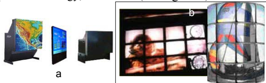
Figure 4: a- [HARP] Visual Communication and b- [Commtech] MultiMedia Videowalls