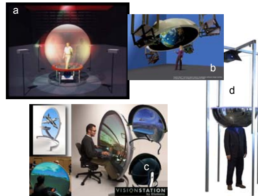
Figure 9: a- VR-Systems [Cybersphere], b- [Trimension]'s Mini V-Dome, c- [Elumens]' VisionStation and d- the [Panoscope] from the Laboratoire de muséographie, Université de Montréal

stalling and starting up the system. However, significant overhead cost must be provided for in the budget. It is thus of paramount importance to define the system requirements very carefully for the application at hand before choosing between an in-house solution and a turnkey solution.