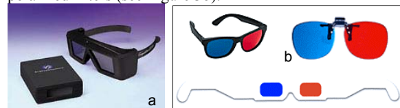
Figure 3: a- CrystalEyes shutter glasses with synchronization box by [StereoGraphics] and b- Different models of anaglyph glasses

Two types of stereo glasses can be found on the market: (i) active stereo glasses or shutter glasses (see Figure 3a), and (ii) passive stereo glasses based on colour filters or polarized filters (see Figure 3b).