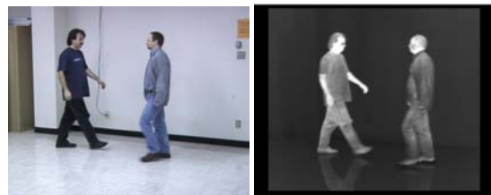
Figure 1. A pair of ‘visible’ (left) and IR (right) frames

a) Video acquisition. For a specified node, the user is able to select among the following options: i) acquisition in the visible spectrum only, and ii) synchronized acquisition of infrared and visible data. It is thus possible to customize each node according to the particular environmental conditions related to the FOVs of its cameras. IR sequences provide enhanced contrast between the human body and the background in a low-lit room, while visible sequences convey rich information about the colour, texture and shape of the pedestrians when proper lighting conditions are available. Moreover, there are situations where a fusion between IR and visible data improves significantly the performance of figure-ground separation. Frame samples from a simultaneous IR/visible spectrum acquisition are shown in Fig. 1.